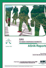
SRI in Asian Emerging Markets Sustainable Economy

China: The Investment Agenda for Building an Environmentally Sustainable Economy